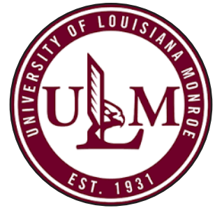
UNIVERSITY OF LOUISIANA MONROE A