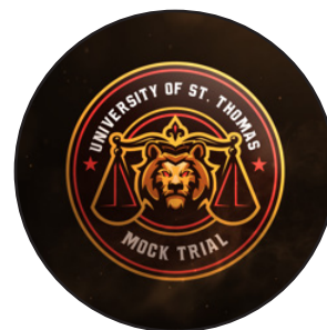
ST. THOMAS UNIVERSITY A